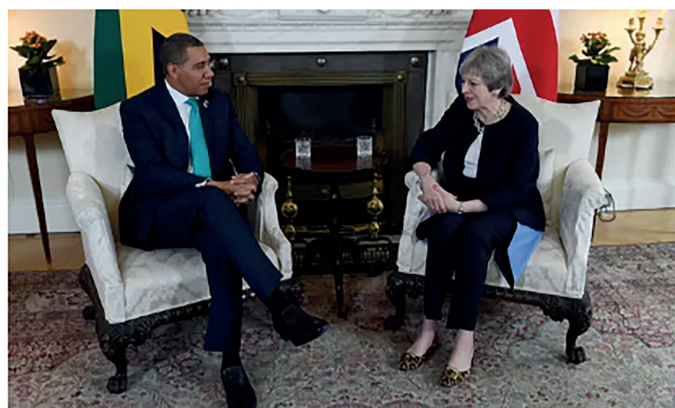
▲ Theresa May with the Jamaican prime minister, Andrew Holness, at Downing Street on Tuesday.

She added: “We would also like to reassure you that there will be no removals or detention as part of any assistance to help these citizens get their proper documentation in place.”