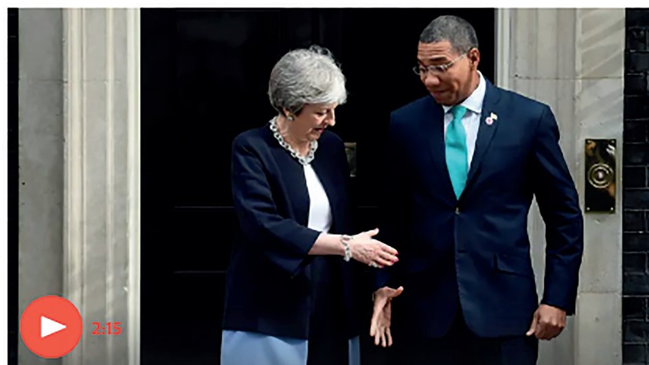
▲ Theresa May apologises for treatment of Windrush generation – video

Theresa May has apologised to the 12 Caribbean heads of government for the treatment of Windrush citizens and promised that no one would be deported.